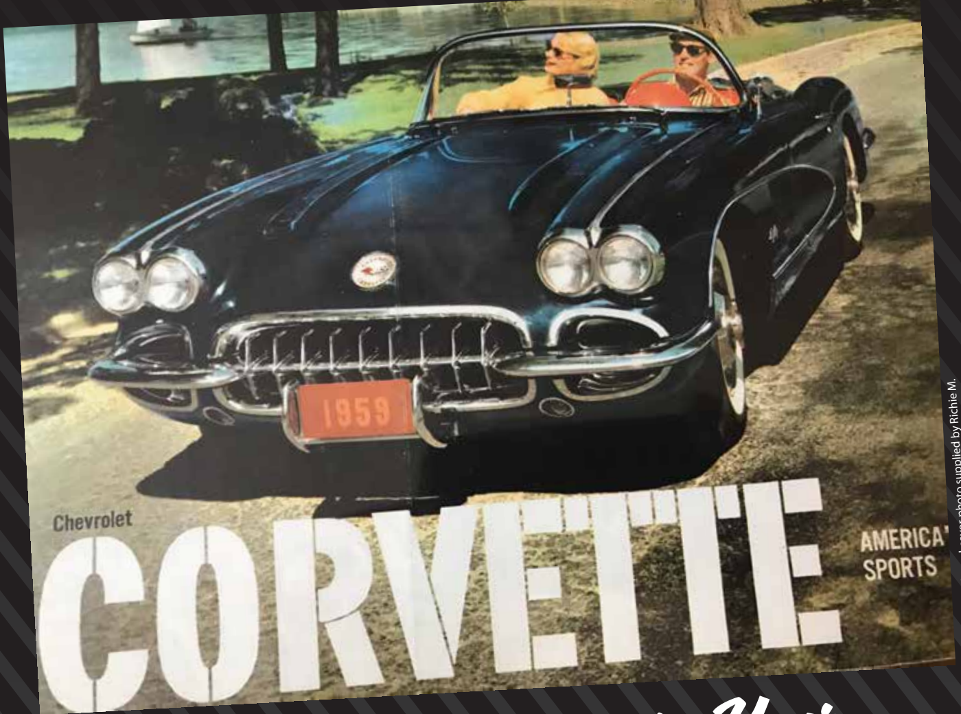
1959 Owners Manual cover

DEDICATED TO THE ENJOYMENT OF THE CLASSIC AMERICAN SPORTS CAR