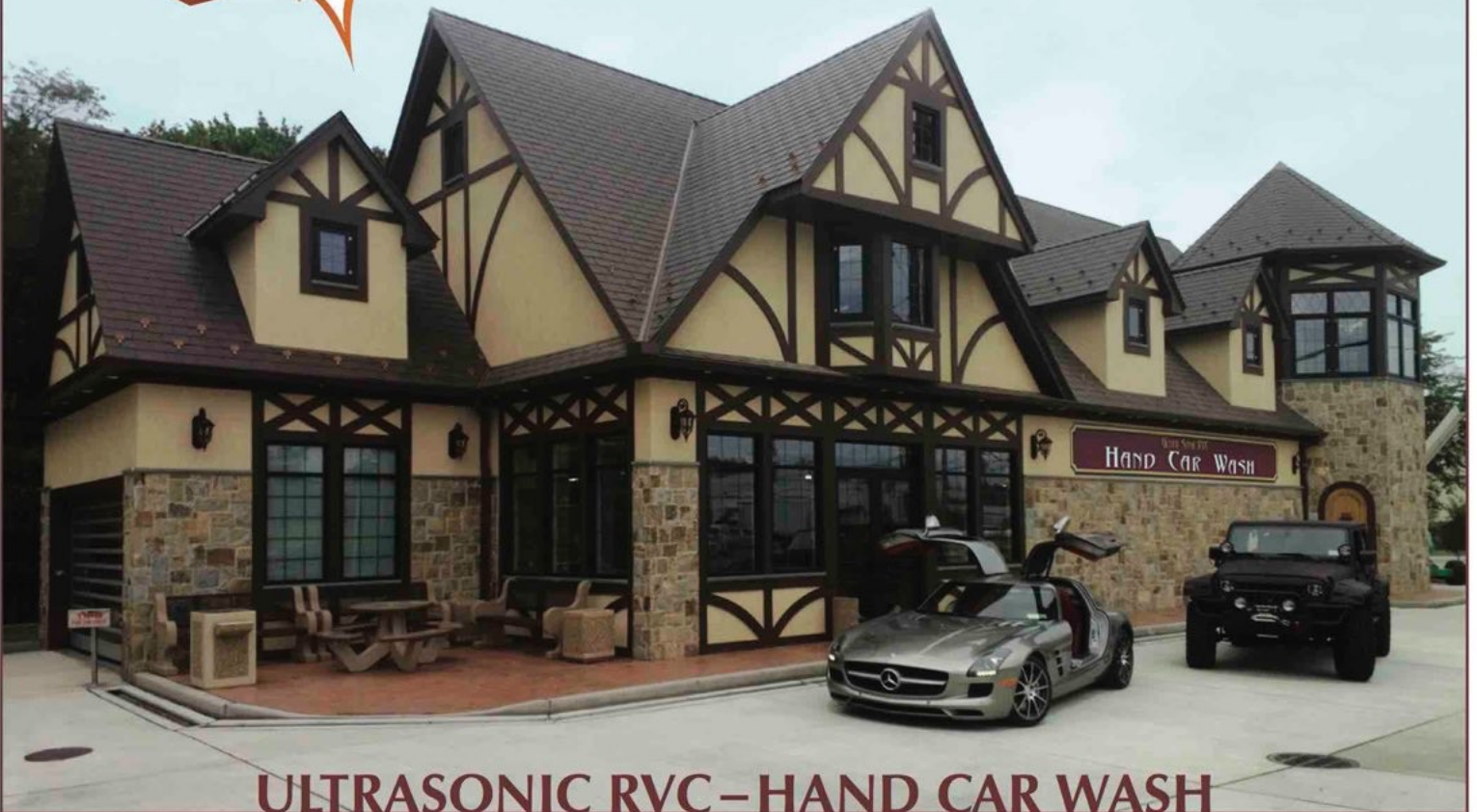
ULTRASONIC RVC – HAND CAR WASH